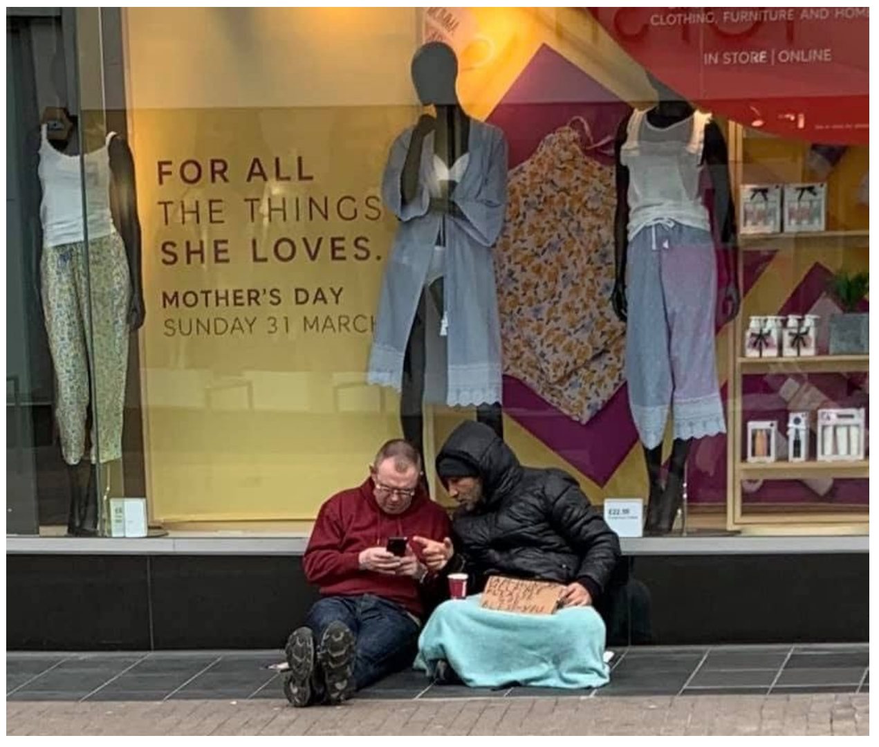
A divinely orchestrated encounter. I spoke 'very little Romanian' {fuarte putin Romanesc} and he spoke even less English. Through speaking into the voice function of 'Google translate' we were able to manage a conversation which led to my praying for him.

God will take us outside of our comfort zone and into the realm of a God encounter.