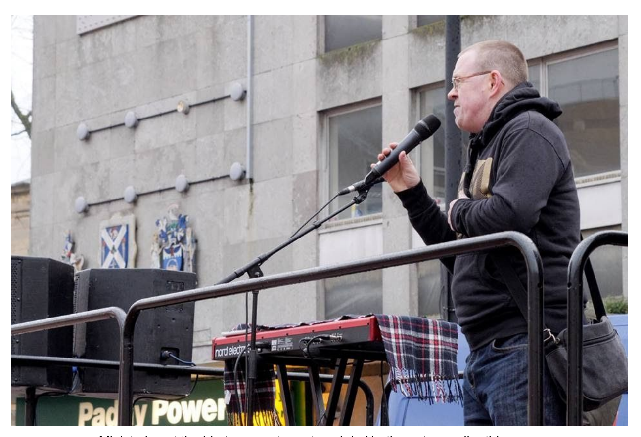
Ministering at the big town centre outreach in Northampton earlier this year