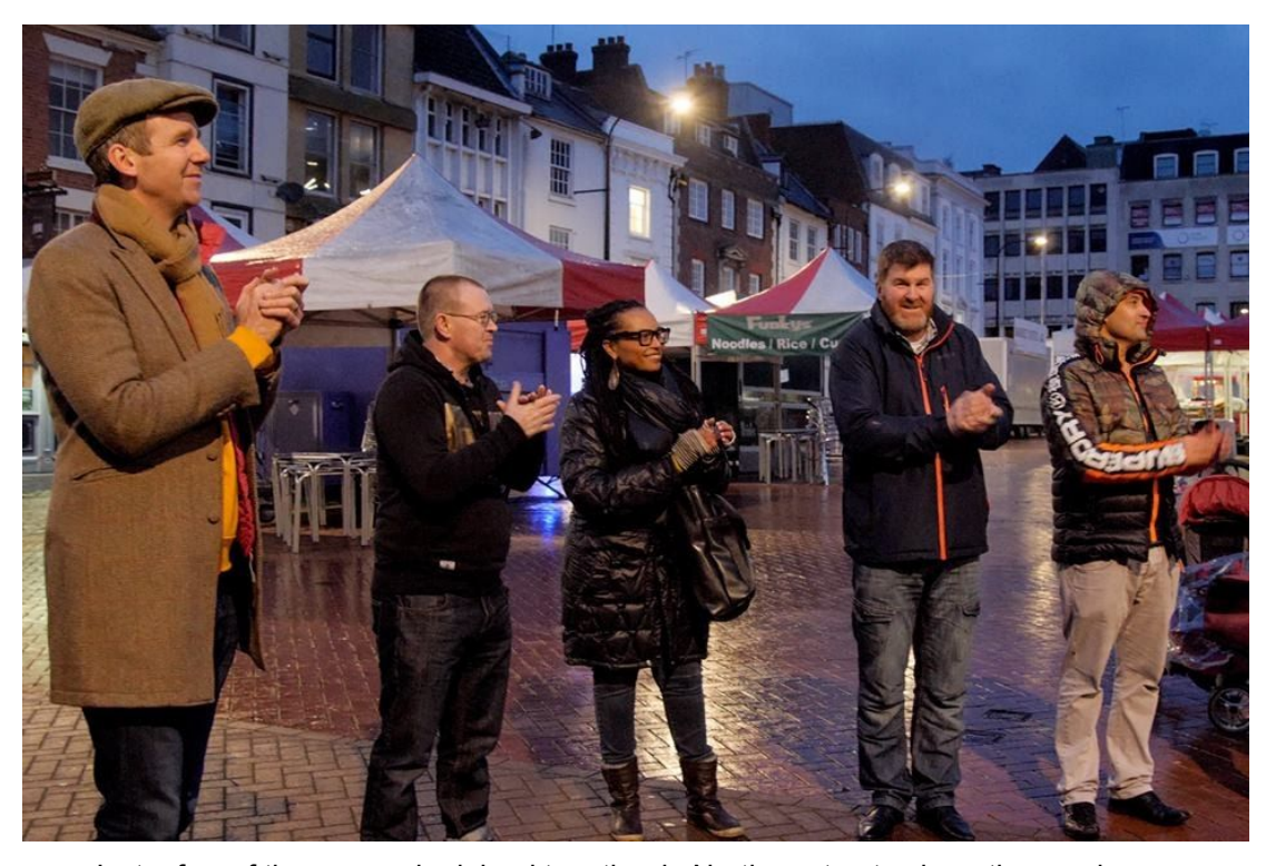
Just a few of the many who joined together in Northampton to share the good news