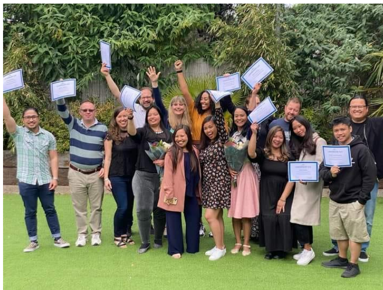
{above picture} Graduation day. Along with numerous others in my church I received my certificate for completing the Every Nation Global Training Program. The aim of which is to establish leaders with strong biblical and theological foundations as ministers of the gospel.