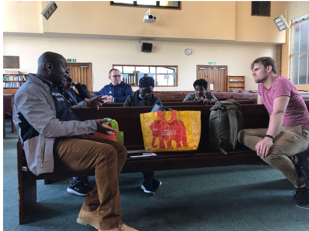
{above picture} The outreach team meeting and praying together. This is a new church connection. K180 are helping this church in Clapham develop an outreach team. Outreach is a new thing for these church members. They are seeing how God is sovereignly in control.